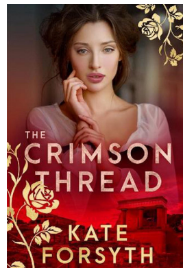
The Crimson Thread Kate Forsyth, 2022